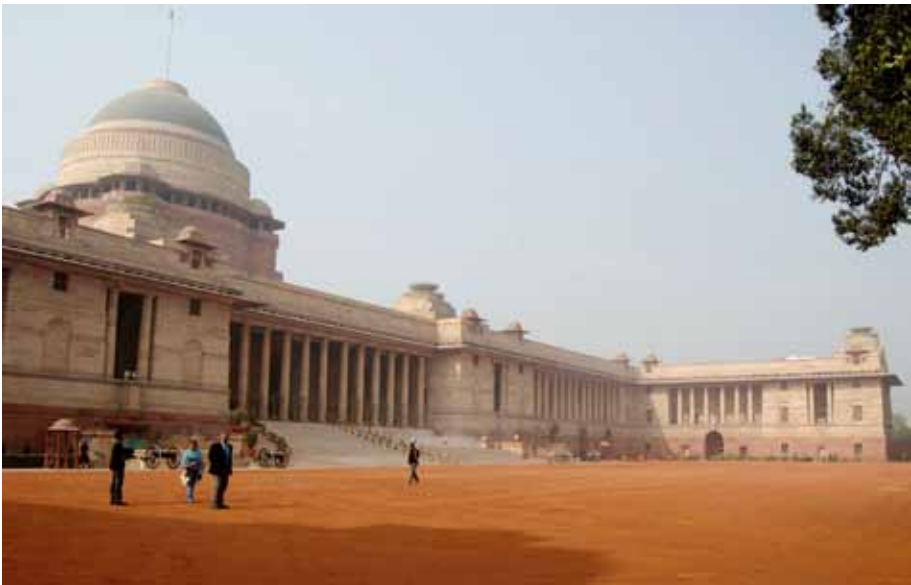
Fig.6. Viceroy's House, New Delhi, India (1912-31) by Sir Edwin Lutyens for the Government of India.