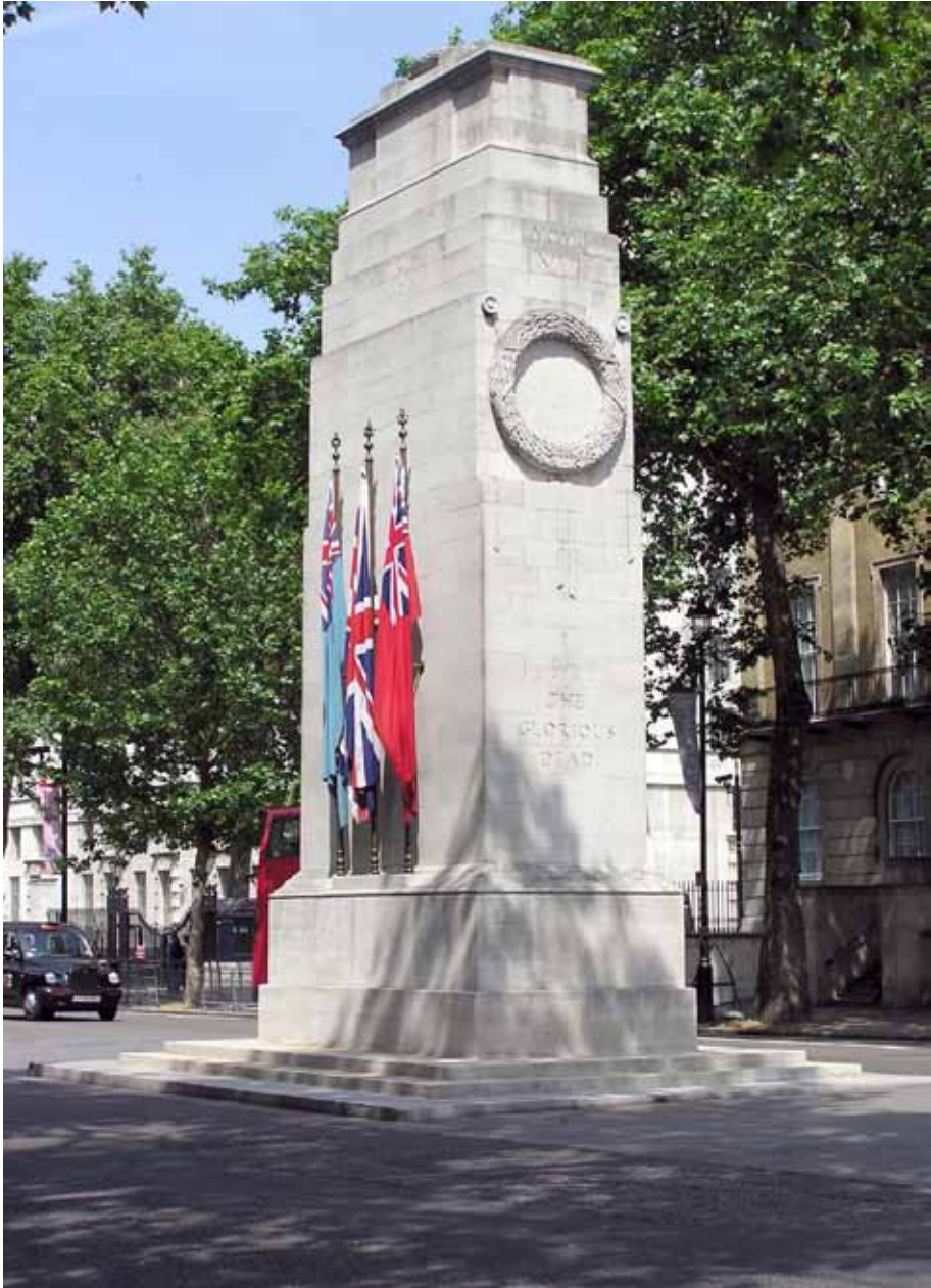
Fig.7. The Cenotaph, Whitehall, London (1919-20) by Sir Edwin Lutyens.