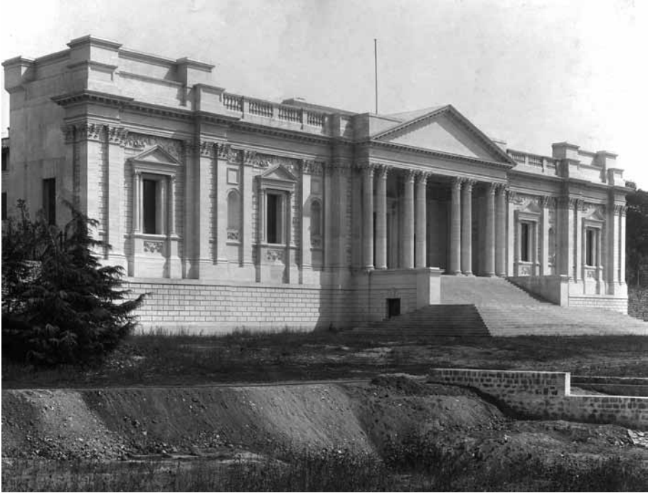
Fig.5. The British School at Rome, façade (1912-16). © BSR Photographic Archive, British School at Rome Collection, bs-0018.