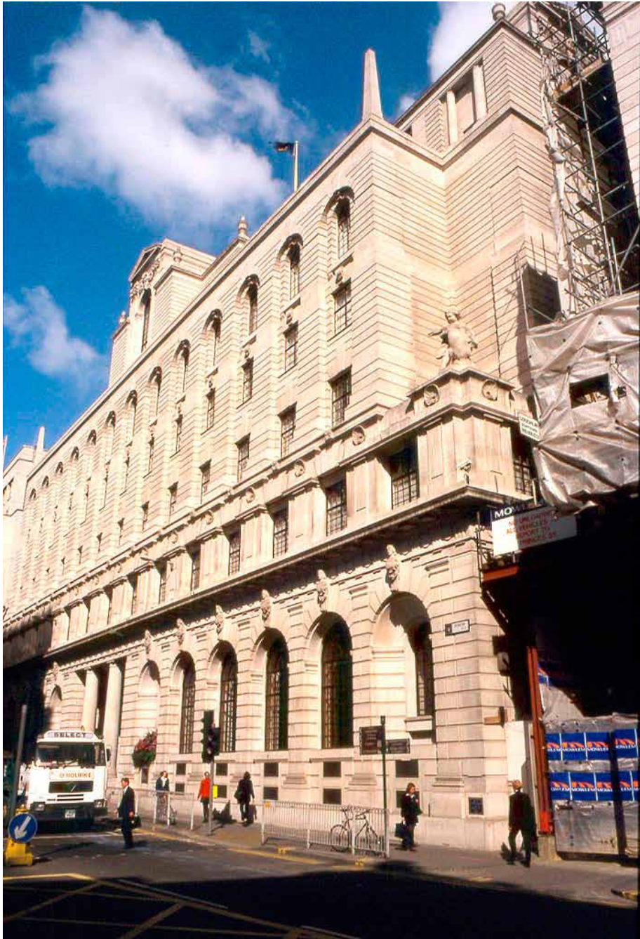
Fig.8. Midland Bank, Poultry, City of London. Headquarters Building (1924-39) by Sir Edwin Lutyens.