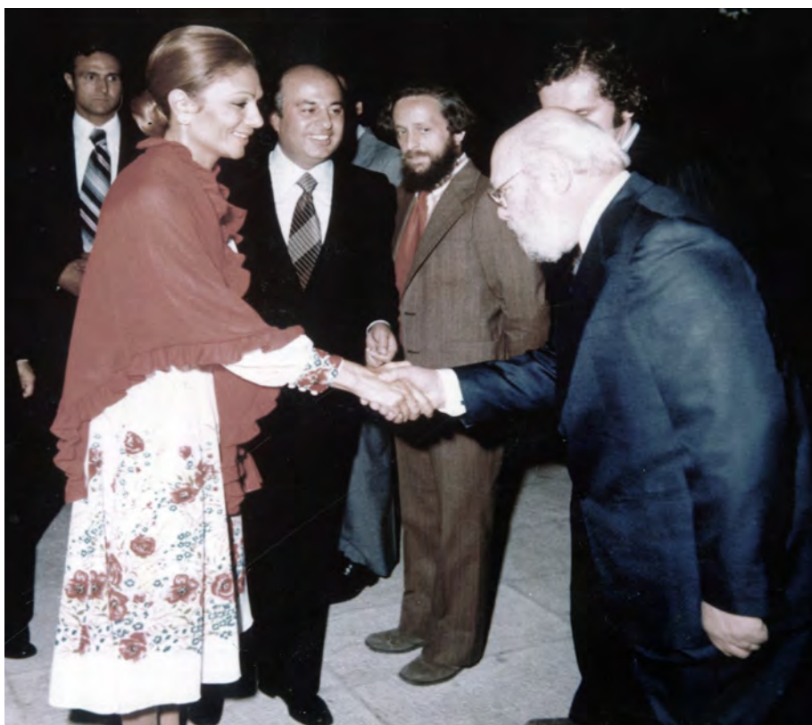
Fig. 3 – Università di Tehran 1977. In occasione della visita della Regina Farah Diba alla mostra "Le Opere di James Stirling". Mehdi Kowsar presenta Ludovico Quaroni alla Regina.

Plan, not only will no problem of the many that afflict the city would be resolved, but the Plan itself would be transformed into a potent expedient in the hands of local speculators who would lay the blame on the Development Plan for their own responsibilities, thus hiding – perhaps with the complicity of others – the damage they will continue to cause to the image and future of this noble city.